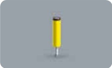
ROD PE 70 266 RE

Fixing accessory available also in stainless steel